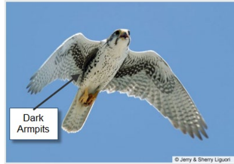
Prairie Falcon Falco mexicanus | Order FALCONIFORMES – Family FALCONIDAE

Typical cliff-side nest site -- here a "pothole" in eroded sandstone