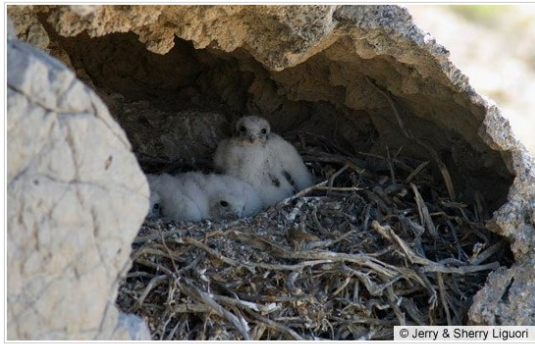
Prairie Falcon Falco mexicanus | Order FALCONIFORMES – Family FALCONIDAE