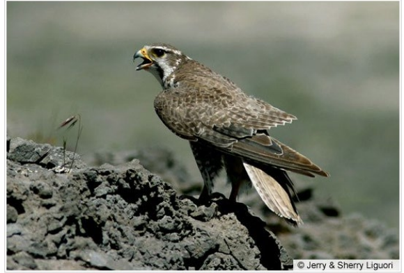
Prairie Falcon Falco mexicanus | Order FALCONIFORMES – Family FALCONIDAE