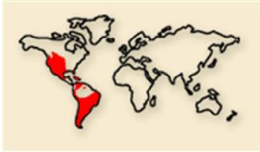
Burrowing Owl Athene cunicularia

Range: The Burrowing Owl can be found in Western North America through Mexico, Central America and parts of South America. A separate subspecies can be found in Florida and the Caribbean Islands. During the breeding season, those in the west can be found in all states west of the Mississippi Valley in the United States and Southwestern Canada. They can be found permanently in the Southwestern states, Mexico and the drier parts of Central and South America. Those found in Canada and the northern parts of the U.S. migrate south during the winters.