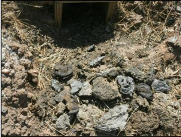
• Owl Nest Entrance Complete With Cow Dung