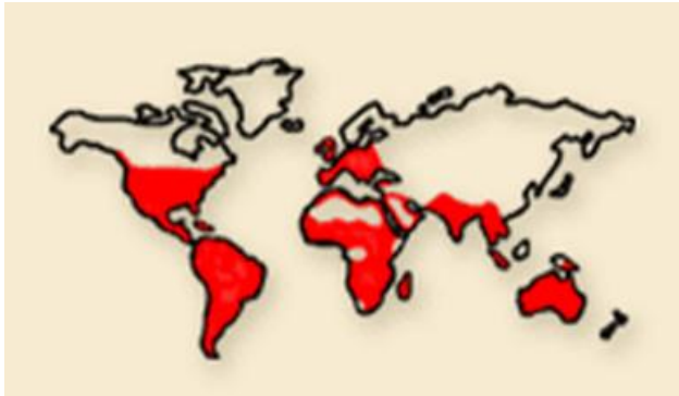
Barn Owl Tyto alba

Range: Barn owls are one of the most widespread of all owls and are among the most widely distributed of all land birds. They will be found on every continent except Antarctica. In the new world, barn owls will be found from northern United States and southwestern British Columbia through Central America and South America. In Europe, barn owls range from southern Spain to southern Sweden and east to Russia. They are also found throughout Africa, across central and southern Asia, and throughout Australia. Their northern range is generally limited by the severity of winter weather and availability of prey. Generally there is little to no major migration. Residents remain during the winters.