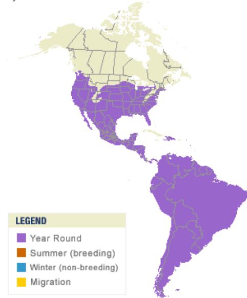
LEGEND ■ Year Round ■ Summer (breeding) ■ Winter (non-breeding) ■ Migration Map by Cornell Lab of Ornithology Range data by NatureServe

Habitat: The Barn Owl lives in a wide variety of habitats including grasslands, deserts, marshes, and farming areas. They prefer open areas at low elevations and require cavities for nesting such as trees, cliffs, caves, church steeples, barn lofts, and other out buildings, hay stacks and nest boxes.