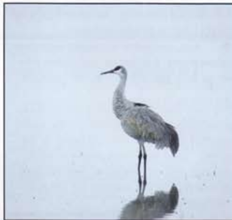
Sandhill Crane at Bosque del Apache

Taking a great photograph is like making a good landing in an A-320: After you do all your careful planning and take great care to set it up perfectly, if you're lucky, it turns out pretty good! Actually, taking good photos is a little easier and not quite