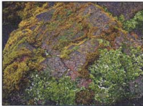
Don't be afraid to use interesting textures in your photos.

The very best "storage media" are your brain and your heart. The images recorded here will be with you forever and you don't need a fancy monitor to enjoy them!