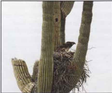
Add an interesting setting to your photos.

So you took your time, didn't scare him off, got some good shots of the preening bald eagle and you didn't fall into the river. Then you got a couple of good flight shots as he took off to return to his hunting perch. You still have some daylight left and your storage card isn't full yet. Don't forget beautiful creatures often live in beautiful habitat. Panoramic shots of wildlife in their natural surroundings are just as effective in telling their story as close-ups. Clouds, sky, scenery, even fog or snow can be a wonderful frame for a wildlife picture, or even as a subject itself.