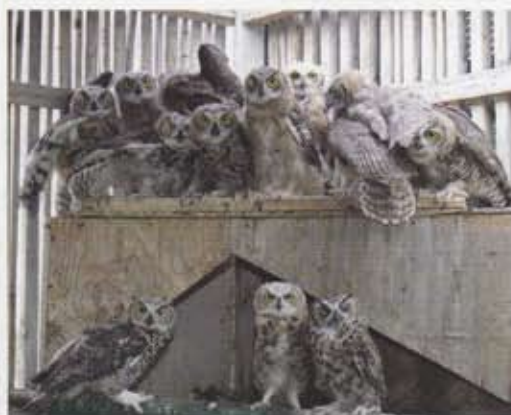
It's getting crowded in here!