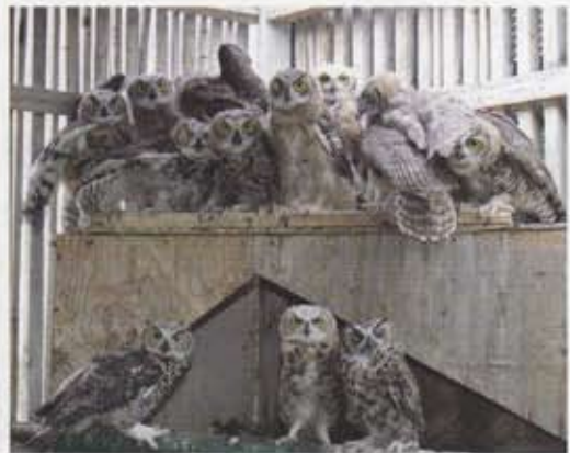
It's getting crowded in here!