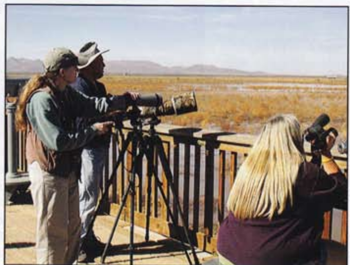
Bird watching at Whitewater Draw Wildlife Area

Major sources of information: Fortune, August 7, 2006; Newsweek, July 17, 2006