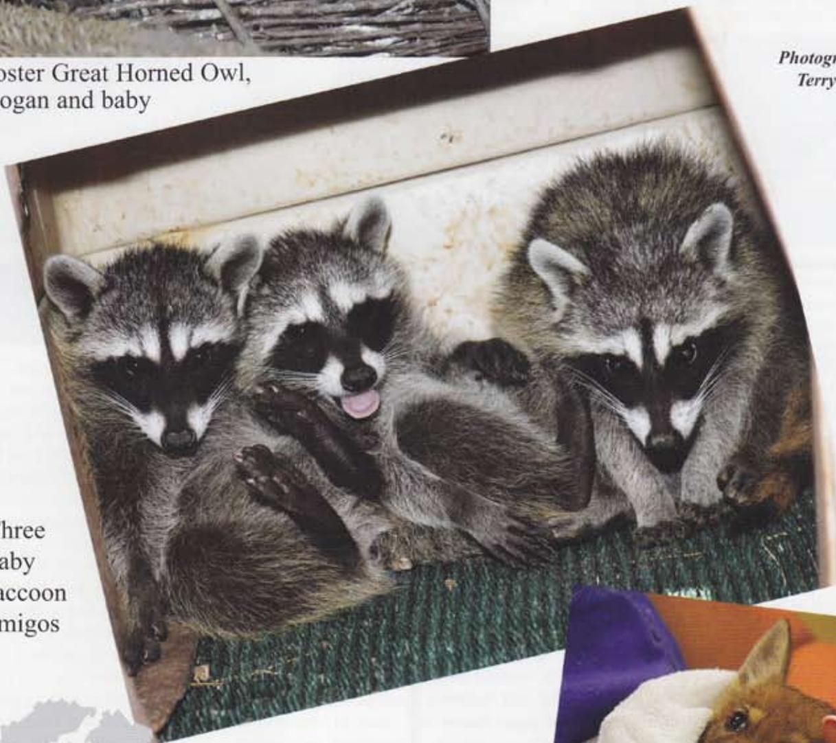
Three baby raccoon amigos