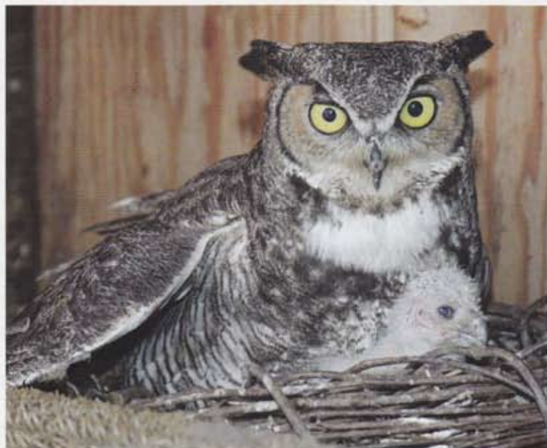
Foster Great Horned Owl, Hogan and baby