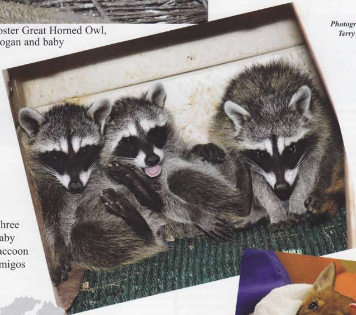
Three baby raccoon amigos