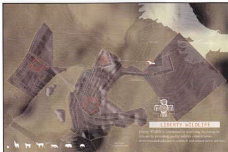
Groundbreaking invitation - topography of new site Design by Made in Space, Inc. Los Angeles, CA