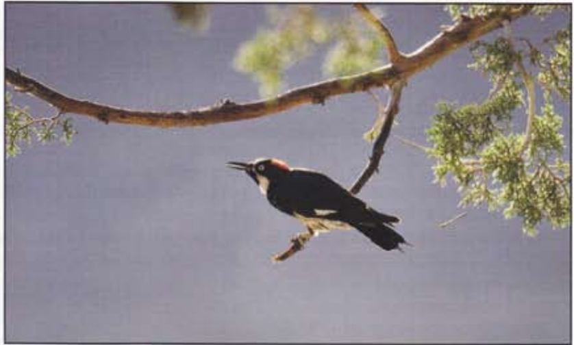
Use direct lighting to enhance the photo of the acorn woodpecker.

If you never get that "National Geographic Cover Shot," it doesn't really matter.