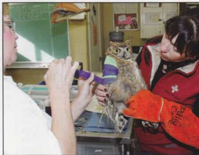
Medical Services provides relief

about the individual animals and their natural history. Then they train further with individual birds until they are qualified to take them out to programs.