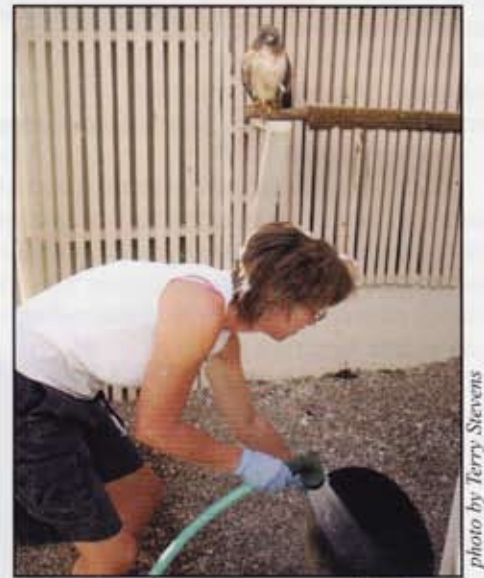
Daily Care volunteer supervised by Acoma, a Red-tailed hawk Education Ambassador

Again, it is entirely because of these dedicated people and many more that Liberty Wildlife is able to save lives and help preserve nature in Arizona.