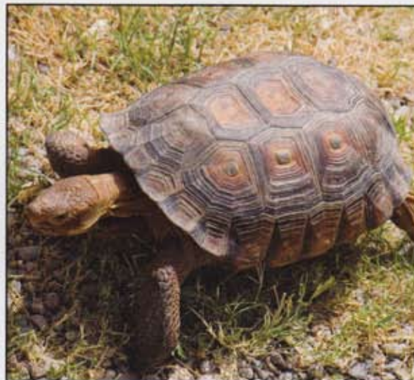
Now that's a desert tortoise